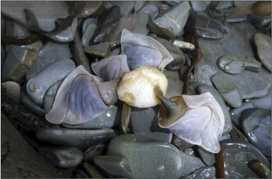
Above: Buoy barnacle Dosima fascicularis , Hell's Gates, 27 September. Below: Trumpet anenome Aiptasia mutabilis , Devil's Kitchen, 27 September.