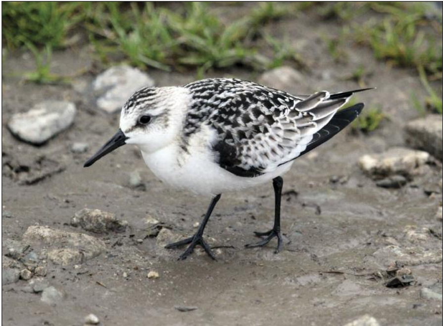
Below: Sanderling Calidris alba , main track, 4 September.