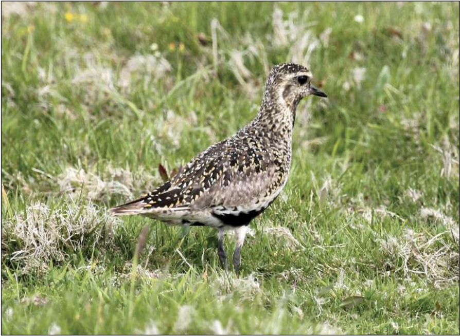
Above: Golden Plover Pluvialis apricaria , South West Field, 9 June.