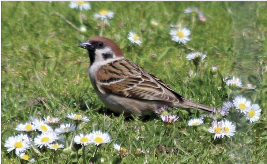
Above: Tree Sparrow Passer montanus , Bramble Villas, 29 May. Below: Colour-ringed Wheatear Oenanthe oenanthe , near Old Light, 23 June.