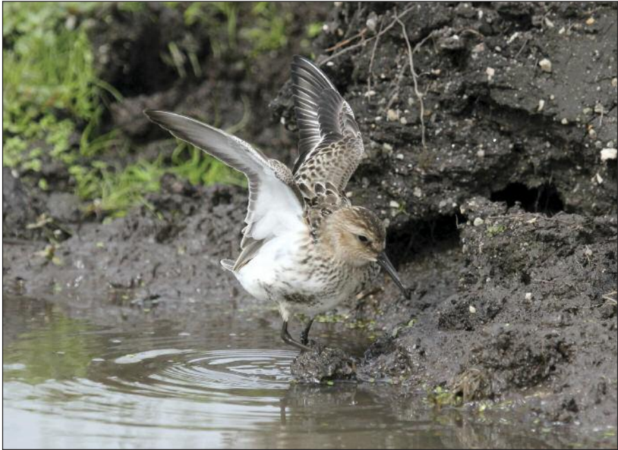
Above: Dunlin Calidris alpina , Brick Field Pond, 2 September.