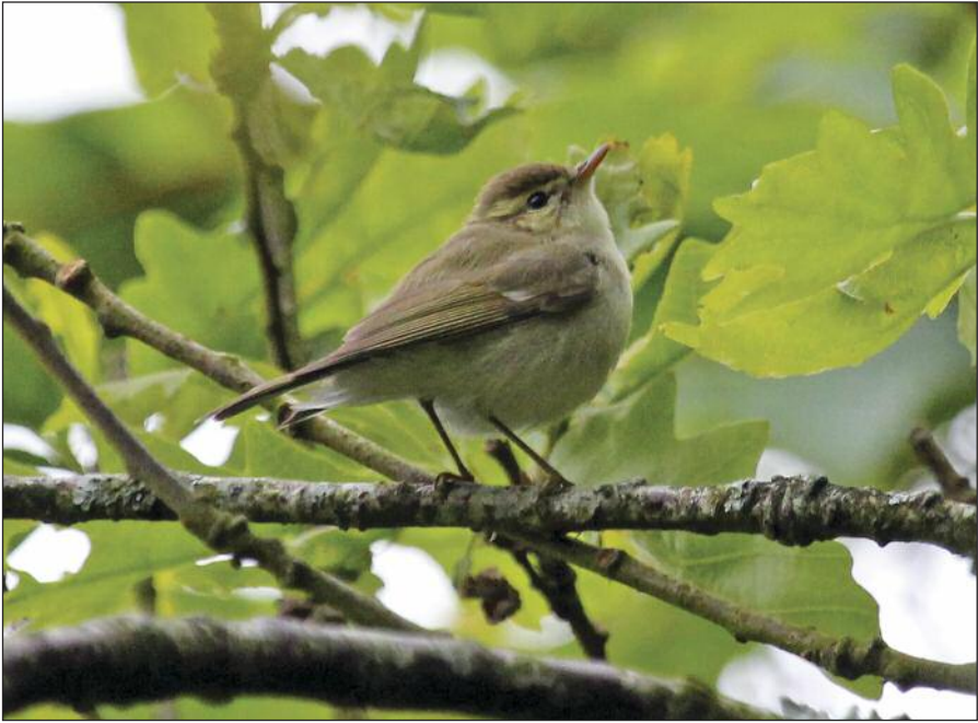
Above: Greenish Warbler Phylloscopus trochiloides , Millcombe, 5 June. Below: Pallas's Warbler , near Rocket Pole, 25 October.