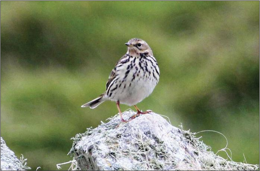
Above: Red-throated Pipit Anthus cervinus , Castle Hill, 18 December.