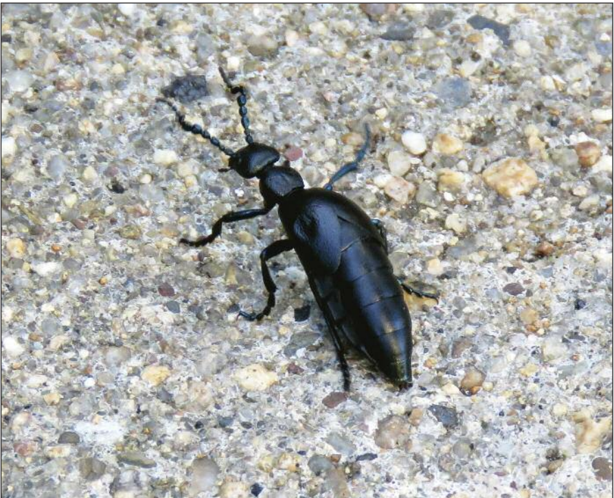
Below: Black oil beetle Meloe proscarabaeus , South Light steps, 16 March.