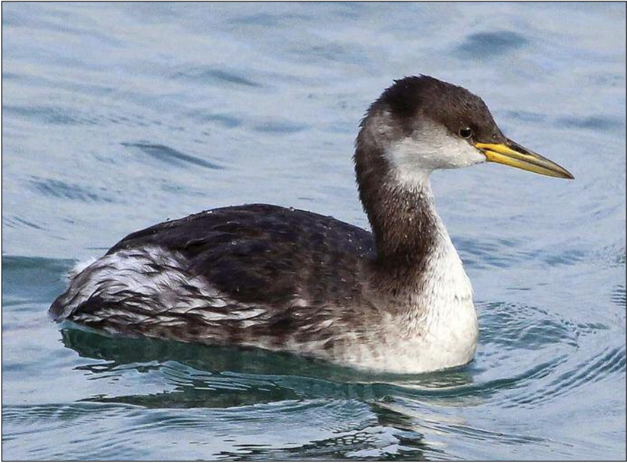
Above: Red-necked Grebe Podiceps grisegena, Landing Bay, 18 December. Below: Puffins Fratercula arctica – prospecting birds near Pyramid Rock, 26 June.