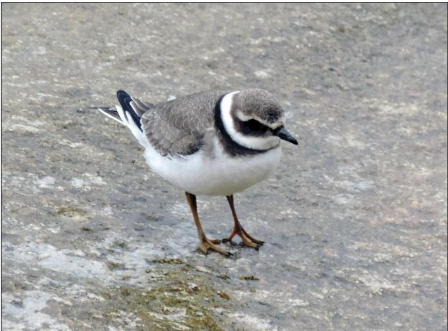
Below: Ringed Plover Charadrius hiaticula , Beach Road, 13 September.