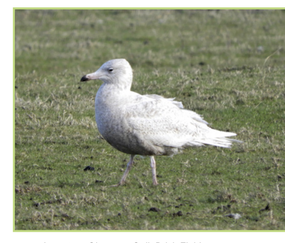
Immature Glaucous Gull, Brick Field, 26th February.

An exceptional year by Lundy standards, with an unprecedented series of multiple sightings involving at least four individuals. A first-winter bird was in the Brick Field. Tillage Field and Ackland's Moor marsh area from 20 Feb to 1 Mar (Dean Jones). An adult on Pondsbury on 5 Mar flew off in the direction of Jenny's Cove (Tim Davis, Dean Jones, Tim Jones). A firstwinter bird at Jenny's Cove on 14 Mar was potentially the same individual seen in late Feb but also seems guite likely to have been a different bird (Dean Jones). A first-year bird was in Lower Lighthouse Field, roosting with a flock of Lesser Black-backed Gulls, on 14 Nov (Dean Jones). Finally, another first-winter bird on 11 & 12 Dec was first seen in Tillage Field (Dean Jones, Martin Thorne). These are the sixth to ninth records for the island, including the first for both Feb and Mar. Records accepted by Devon Bird Recorder.