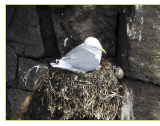
Kittiwake with the first chick of the year, Jenny's Cove, 13th June (photo: Dean Jones).

to 6 Mar. The only four-digit count logged during the autumn and second winter period was 1.000 on 27 Oct, again involving flocks feeding off the East Side. An all-island count of cliff-nesting seabirds on 16 Jun yielded a total of 242 adult birds, whilst the total number of nests located during the season was 308 - a reduction of 41 on the 2019 total. The first egg was seen at the Threequarter Wall Buttress colony on 15 May. whilst the first chicks were logged here and at the Aztec Bay colony on 13 Jun – although the great majority of adults were still incubating in mid-Jun. By the end of the month, 105 nests within the productivity study plots contained chicks. The first fledging was observed on 19 Jul. Final analyses showed that a total of 101 chicks fledged from the combined total of 152 apparently occupied nests (aon) at the Aztec Bay colony (124 aon) and Threequarter Wall Buttress colony (28 aon), representing 0.66 chicks fledged per active nest. Although this was higher than for any of the three previous seasons (0.59 in 2019, 0.46 in 2018 and