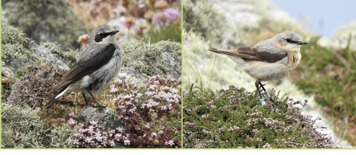
Male (left) and female colour-ringed Wheatears, Pilot's Quay, 3rd June.