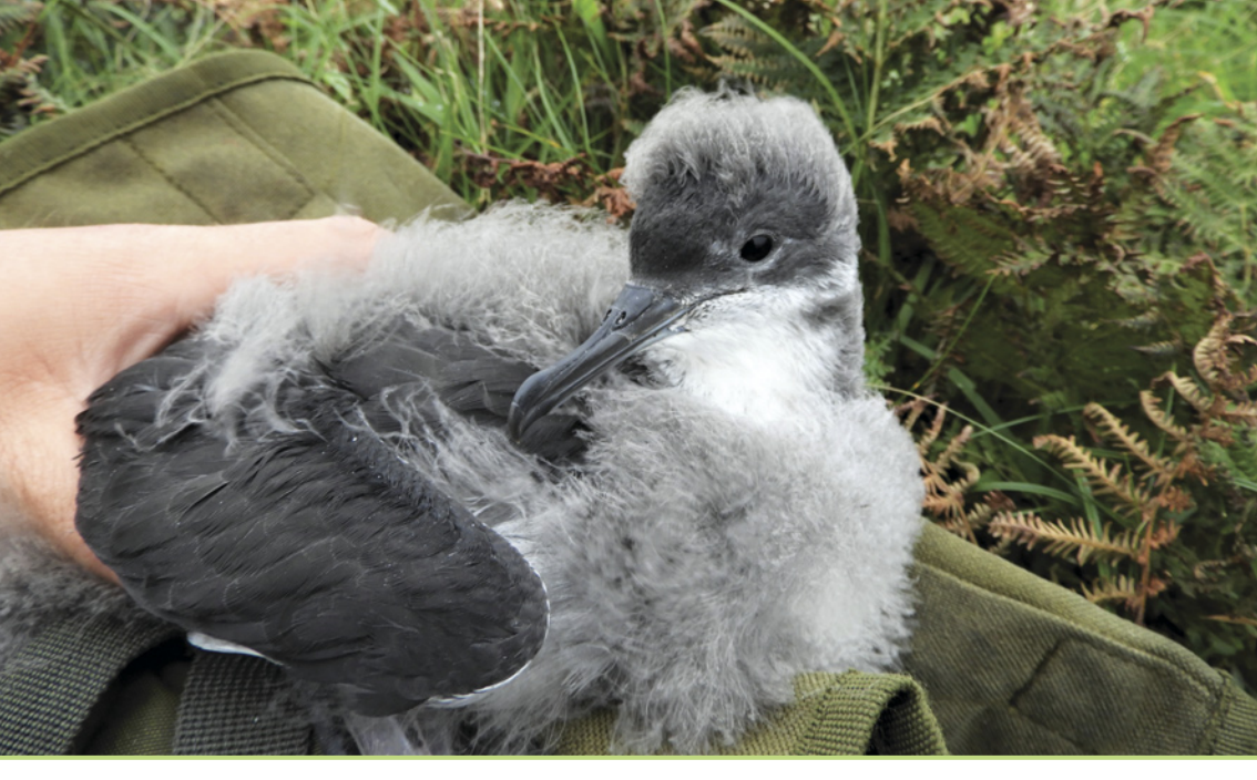
Manx Shearwater chick from the Old Light colony nestboxes, 24th August.