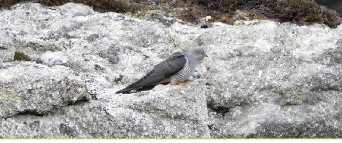
Cuckoo, Halfway Wall, 27th April.