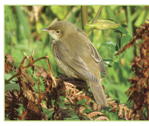
Marsh Warbler, St John's Valley, 6th September.

The first Magpie to be seen since 1996 was briefly near the Black Shed on 5th, whilst an Icterine Warbler was in Millcombe the same day, and a Marsh Warbler spent much of the morning of 6th in St John's Valley. Lundy's first ever Sora Rail was found in remarkable circumstances near the Terrace Heligoland Trap on 12th (see p.49) – with a juvenile Red backed Shrike seen in the same general area earlier in the day. A Goshawk flew in off the sea, as banks of fog rolled in, and perched briefly in VC Quarry on 15th. The first Spotted Redshank for a decade was seen and heard on several occasions on 16th & 17th, whilst a juvenile Dotterel was in South West Field on 27th. Single Dartford Warblers were found in the gorse near Pondsbury on 10th and by the Rocket Pole on 17th, and there was a Wryneck along the Terrace on 22<sup>nd</sup>.