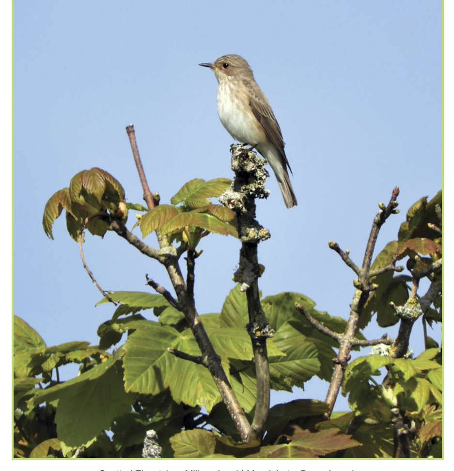
Spotted Flycatcher, Millcombe, 1st May.