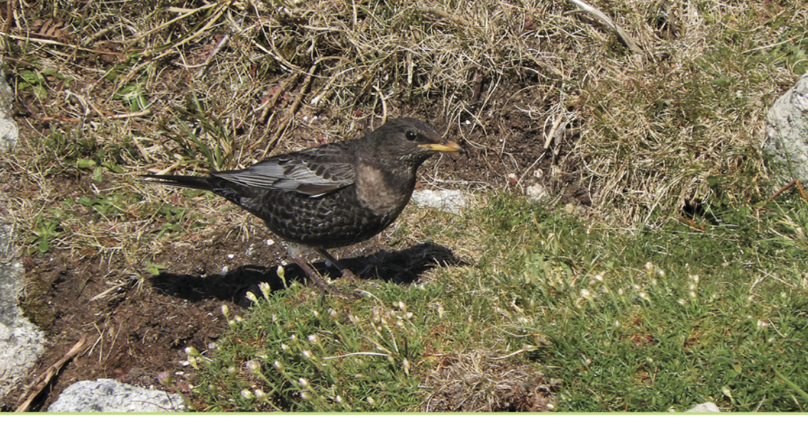
Female Ring Ouzel near Old Light, 14th April.