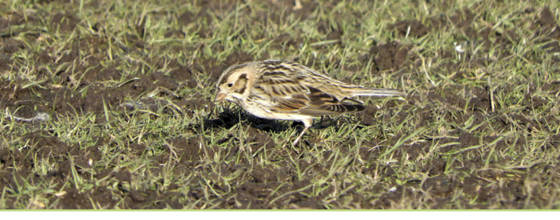
Lapland Bunting, Brick Field, 13th February.