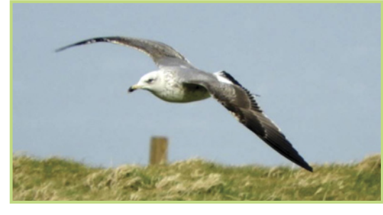
Second-winter Yellow-legged Gull over the Tillage Field, 18th February

Increased year-round attention to gulls on Lundy, greater awareness among birders of key identification features for juveniles and immatures, and growing numbers of Yellow-legged Gulls reaching south-west Britain (particularly in late summer) combined to make 2020 an exceptional year for this species on the island. A third-calendar-year (= second-winter) bird in Tillage Field on 18 Feb and around Ackland's Moor marsh on 19th (Dean Jones) was only the second record for the island, the previous occurrence being as far back as May 1999. Aug saw an unprecedented influx of juveniles, involving up to seven individuals, including three that arrived in the wake of south-westerly storms on 5th. Of these, one was seen from the Ugly during a morning seawatch (Dean Jones); the other two were