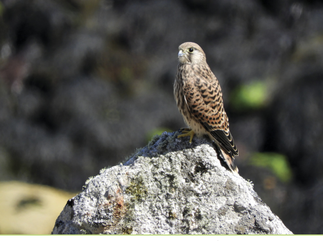
A juvenile Kestrel, one of two that fledged from an East Side nest, 6th July (photo: Dean Jones).

Among landbirds, the first young Peregrines of the season took to the wing on 1st, the Swallow brood fledged from the Church porch over the weekend of 4th/5th, and the Spotted Flycatcher pair in Millcombe were feeding four small young in the Casbah on 6th, the same day that two Kestrels fledged from a nest along the East Side - the first successful nest on the island since 2005. Another brood of young Blackcaps (clearly reared by a different pair to the family party seen in late June) was in Millcombe on 9th and adult Chiffchaffs were feeding a single fledgling there on 14th. Sadly, the flycatcher chicks were found dead in the nest on 10th – a casualty of the poor weather in preceding days, which had made it near impossible for the adults to find food.