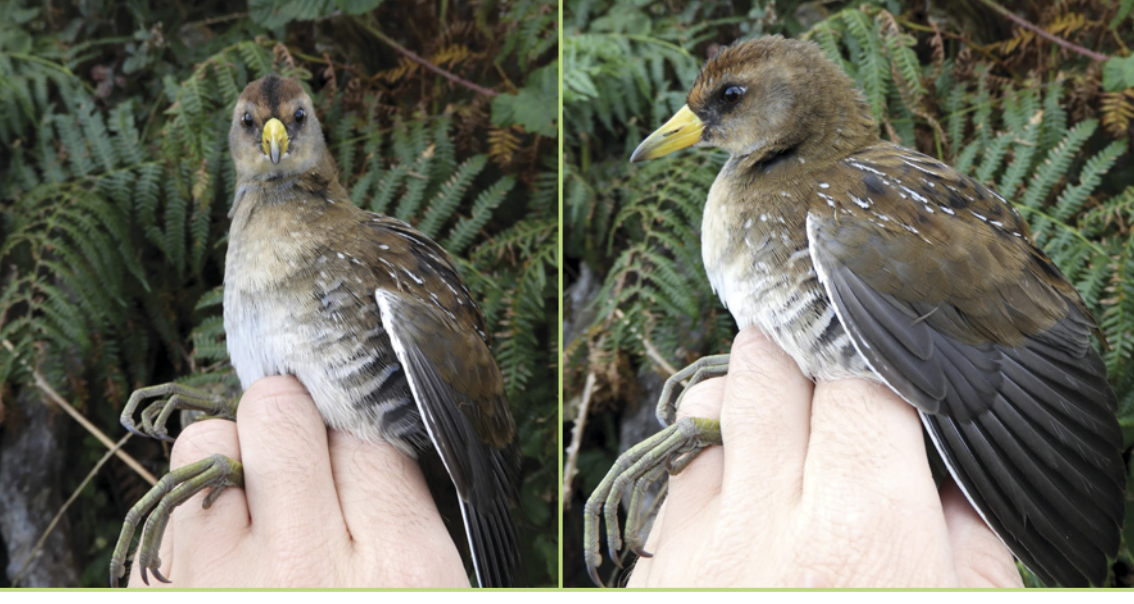
Lundy's first Sora Rail, Terrace, 12th September.