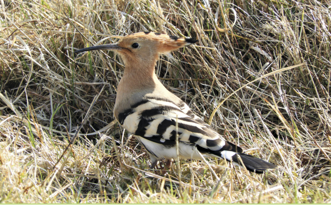
Hoopoe, main track near Pondsbury, 10th April (photo: Dean Jones).

Hirundine migration was decidedly slow to get going, with 122 Swallows on 14th being the first three-digit count. However, numbers reached some 1,750 on 22<sup>nd</sup>, alongside 140 House Martins, whilst the highest Sand Martin count of the month came on 23rd when 130 were logged. Numbers of passage Wheatears appeared lower than in many recent years, with 92 on 15th being the highest count. Large, brightly marked birds typical of the Greenland-breeding race were seen on at least six dates from 9th. The first Whimbrel was below North Light on 15th and six Dunlin were in South West Field on 16th, the same day that Linnet numbers peaked at 143. Ring Ouzels were recorded on ten dates, mainly during the third week of Apr, peaking at four on 18th, the same day as the first Lesser Whitethroat and Cuckoo appeared along the Terrace, followed a day later by a Swift over the Battery, a single Garden Warbler and Reed Warbler in Millcombe and two Whinchats in South West Field. The last week or so brought a lone Siskin over Millcombe on 22<sup>nd</sup>, a Curlew and a female Reed Bunting on 23<sup>rd</sup>, a Common Sandpiper in the Devil's Kitchen on 26th and two Wood Warblers in Millcombe on 28th