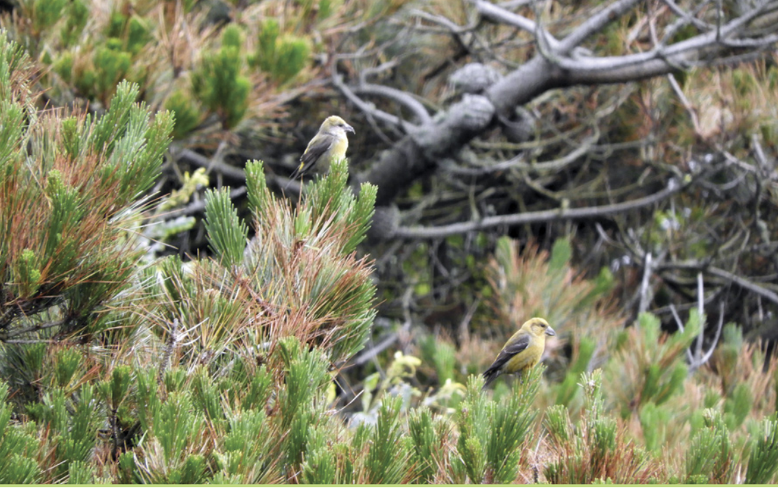
Female Crossbills, Millcombe, 19th June.

were still gathering nesting material on 7 May. The first fledglings were logged on 2 Jun in South West Field (Dean Jones). Post-breeding flocks began to build up in late summer, with maxima of 96 on 15th Jul, 204 on 9 Aug and 250 on 11 Sep. Thereafter, autumn passage produced eight further three-figure counts to mid-Oct, the last of these being 123 on 16th, dropping away sharply to a trickle of single-digit counts from the end of Oct, through Nov and early Dec, to the last of the year, a single bird on 11 Dec.