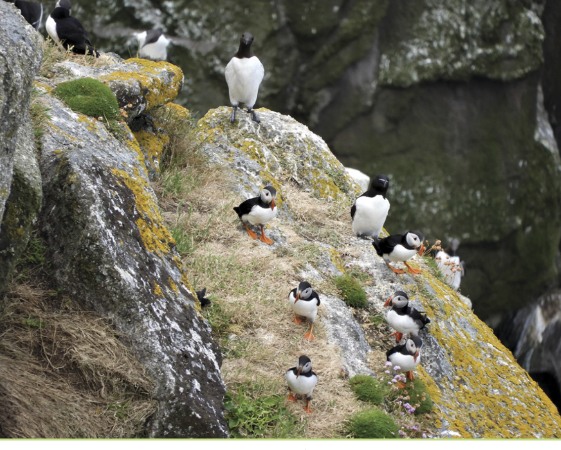
Cliffside auks in Jenny's Cove, 31st May (photo: Dean Jones).

A typical scattering of unusual or unseasonal avian visitors included six Jackdaws over Jenny's Cove on 1st (with two more calling from the Barn roof on 25th), a Buzzard over the Village on 9th, single Lesser Whitethroats in Millcombe on 10th & 29th, one or two Great Northern Divers on 19<sup>th</sup> & 24<sup>th</sup>, a Mistle Thrush in Barton Field on 22<sup>nd</sup>, a Grey Wagtail in Millcombe on 27<sup>th</sup> and the first Grey Heron of the year – at Pondsbury – on 29th. Small arrivals of Woodpigeons to the East Side (11 on 8th and 16 on 18th) - alongside the more typical spring influx of Collared Doves were definitely also in the 'unusual' category, whilst a purring Turtle Dove in Millcombe on 7th arguably qualifies for genuine rarity status these days. A pair of Bullfinches foraging in Turkey Oaks behind Brambles on 31st provided a very unexpected way to close the month!