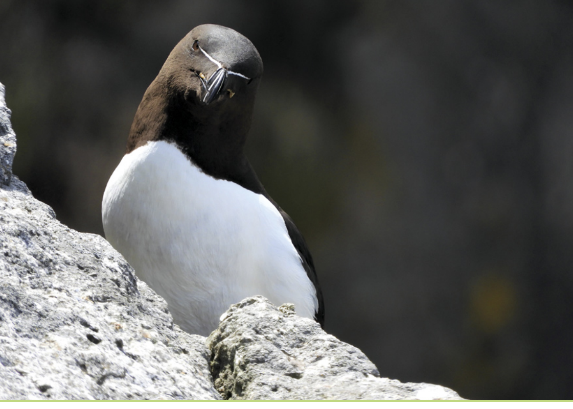
Razorbill, Aztec Bay, 20th June.