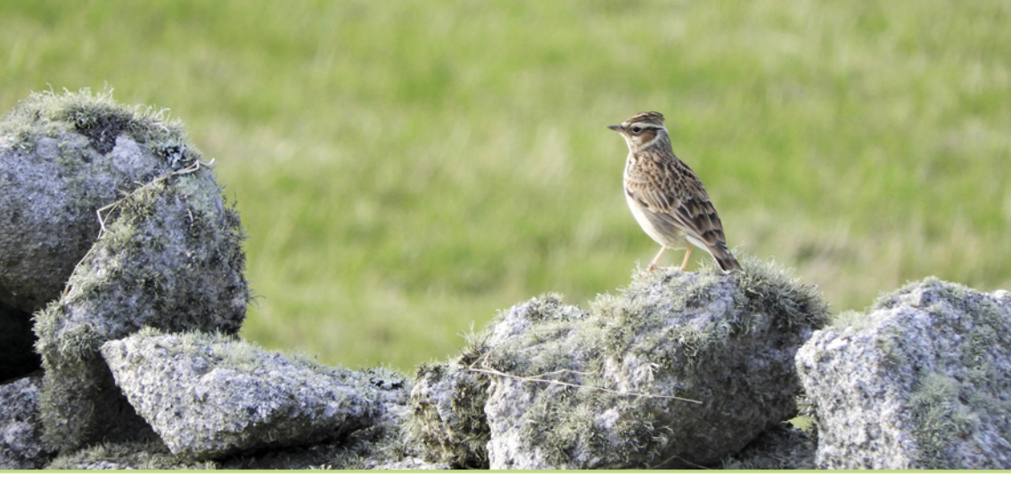
Woodlark, Benjamin's Chair, 22<sup>nd</sup> October.