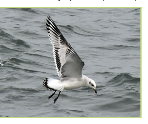
1st-winter Mediterranean Gull off the Jetty, 8th December.

A first-winter bird was first seen foraging off the Terrace on 19 Jan. What was thought to be the same individual was then off the East Side on 28 Jan, closer in to the Landing Bay on 12 Feb, with foraging Kittiwakes off the southern tide race on 18 & 23 Feb, and then in the Landing Bay again on 26 Feb. An adult was in the Landing Bay, feeding with a small group of gulls just below the Ugly, on 19 Feb, close to the first-winter Little Gull in the southern tide race on 23 Feb, and again with the first-winter bird in the Landing Bay on 26 Feb (Dean Jones). These are the 8th & 9th LFS records.