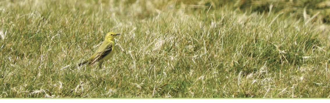
Male Yellow Wagtail, High Street Field, 10th April (photo: Dean Jones).