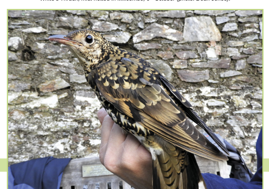
White's Thrush, mist-netted in Millcombe, 9th October.

A typically wary and elusive individual was seen in Millcombe during the early morning of 7 Oct but could not be relocated after about 08:30 hrs (Dean Jones). However, it was trapped and ringed on the morning of 9th, when it was aged as a first-year bird, though its wing length was in the overlap zone between male and female (Nik Ward). Thereafter, it was seen intermittently in Millcombe over the next two weeks, mainly frequenting the wooded area on the south side of the valley, though often seeming to 'disappear' for long periods and usually being seen briefly – either in flight or perched in dense cover – though a few lucky observers had more prolonged views of it perched. It was retrapped on 17th (Rob Duncan), when it was found to be in good health, having put on significant body fat, and seen feeding in the relative open near Government House on 22nd. There has been one previous Lundy record – a first-year male, also in Millcombe, that was first seen on 15 Oct 1952 and remained on the island until 8 Nov. Record accepted by BBRC.