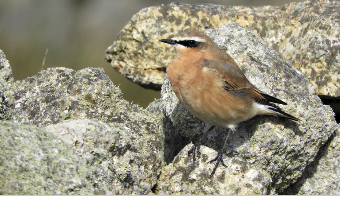
Wheatear (Greenland/Iceland race), Paradise Row, 29th September.

the grass outside the Tayern, others close to the front doors of surprised island staff. Though the number of birds involved appeared to be quite low, this shows the adverse impact that artificial light can have, especially at times of peak fledging if visibility is also poor due to low cloud or seafog. Visiting ringer Richard Taylor was particularly startled to find a 'crash-landed' fledgling shearwater partly concealed in a narrow strip of long grass on the Beach Road, only about 50 m from the jetty, moments after stepping ashore from MS Oldenburg on 5th. Rich rescued the youngster from its vulnerable position, kept it in a safe, dark place during the remainder of daylight hours, then released it that night, happily none the worse for its unorthodox introduction to a lifetime of mastery of the seas and skies, spanning both northern and southern hemispheres.