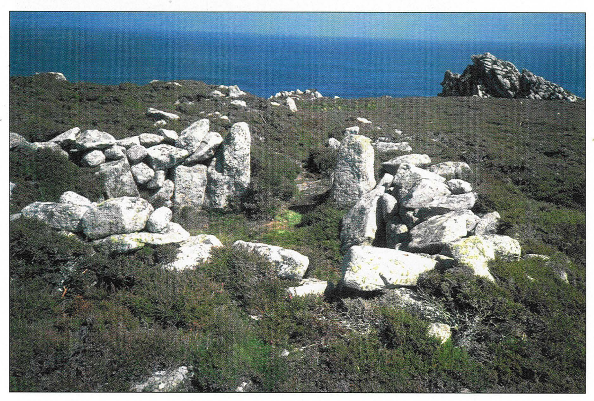
Plate 4 One of the best preserved prehistoric hut circles at North End.