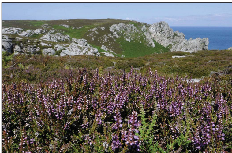
Plate 2. An example of the Calluna vulgaris dominated lowland heathland at the north end of Lundy.