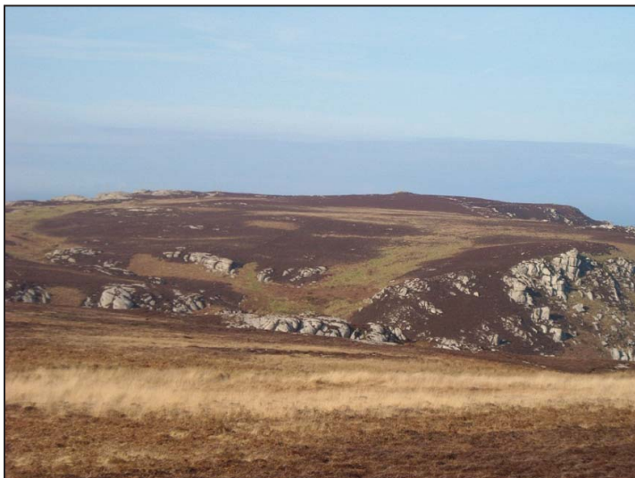
Plate 1: Calluna vulgaris -dominated lowland heathland at the north end of Lundy.

The lowland heathland sites were defined as areas below 300m elevation in which ground coverage of Calluna vulgaris was \geq 25\% . An example of the heathland on Lundy is given in Plate 1. To place the heathland on Lundy in a national perspective, data were compared with 25 other sites on the British mainland, with nitrogen deposition levels above and below that on Lundy. All 25 sites had an annual rainfall in the range 549-836mm per annum, with Lundy falling within that range (774mm). Modelled values of current N deposition at the heathland sites were obtained from 5x5km gridded data sets provided by R.I. Smith (pers. comm., CEH, Edinburgh). The data were derived using an atmospheric deposition model parameterised for moorland terrain (Smith & Fowler, 2001). The model uses a simulated rainfall field for the UK generated by the UK Meteorological Office (data from which was also available for this study), and interpolated N deposition maps derived using measurements from the UK Acid Deposition Monitoring Network (AEA Technology plc., Didcot, UK).