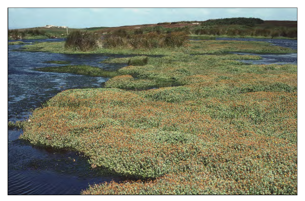
Plate 2: Pondsbury in August 1979 showing the extensive beds of Marsh St John's Wort, Hypericum elodes .