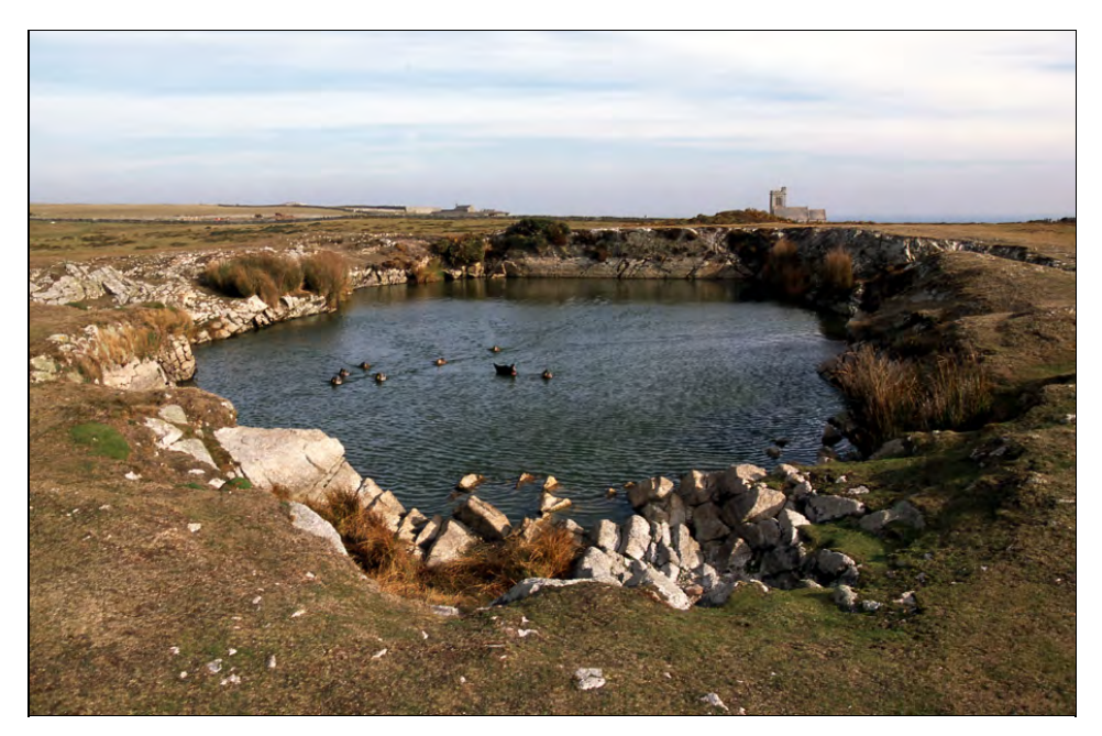
Plate 3: The Rocket Pole Pond in April 2005 with St Helena's Church in the background.