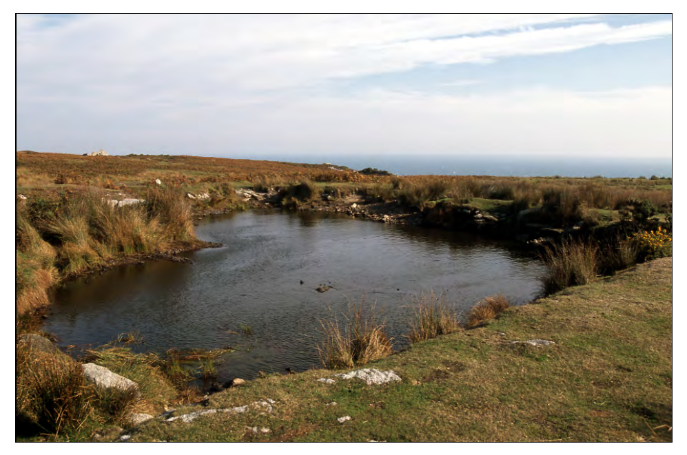
Plate 5: The larger pond at Quarterwall in April 2005.