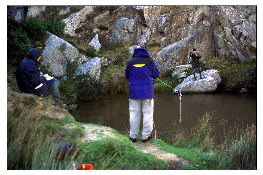
Plate 4: Depth measurements being taken at Quarry Pool in October 2003.