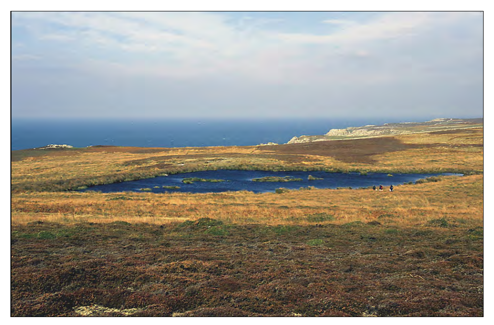
Plate 1: Pondsbury in October 2003.