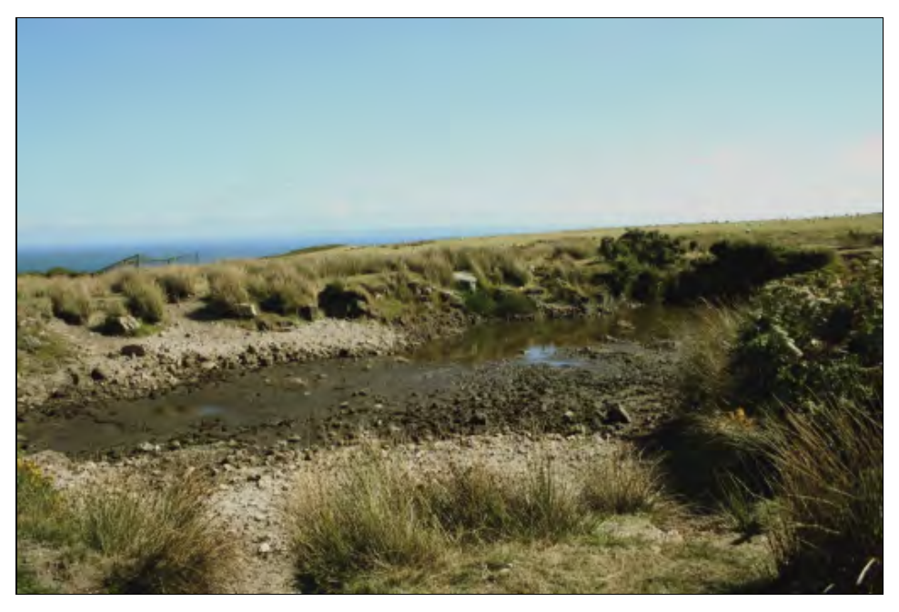
Plate 6: The larger pond at Quarterwall in August 2006 showing the effects of the summer drought. In September it dried up completely.